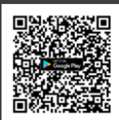
The Application IR PLUS AGM, iOS system, Version 14.5 upwards

On the date of meeting, all shareholders are encouraged to access to the Application IR PLUS AGM, and insert Pincode for registration with attending to the meeting.